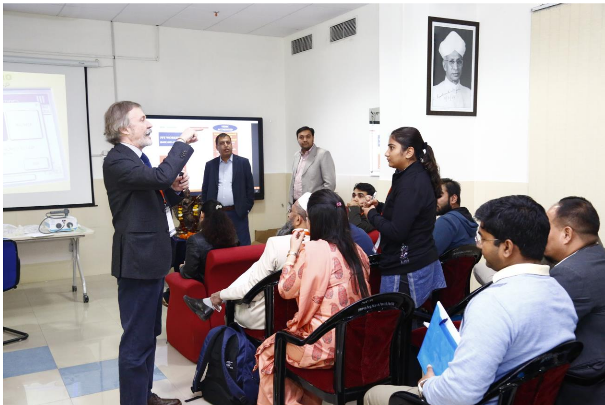
4. Uttarakhand Chapter of Indian Chest Society AIIMS Rishikesh, 18.11.2018